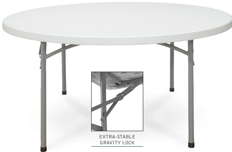
EXTRA-STABLE GRAVITY LOCK