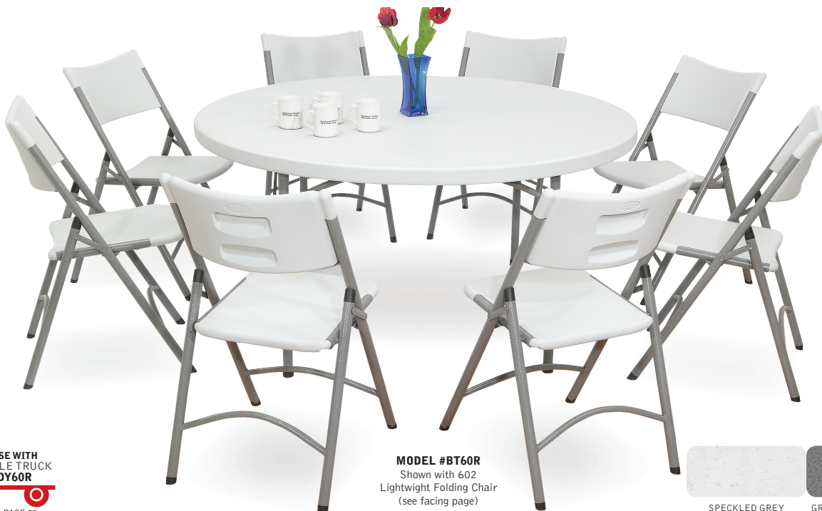
MODEL #BT60R Shown with 602 Lightweight Folding Chair (see facing page)