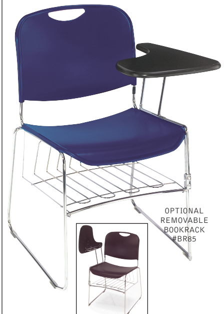
OPTIONAL REMOVABLE BOOKRACK #BR85